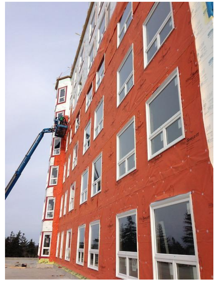
Over 75,000 sq.ft. of WrapShield Water Resistive Vapor Permeable Air Barrier Membrane was installed.