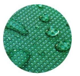
WallShield water vapor transmission: 212 perms, highest in the industry

WallShield Membrane Construction (above)