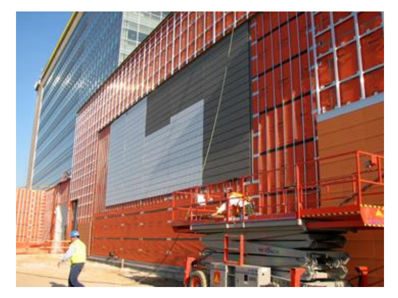
Over 40,000 sq.ft. of WrapShield Water Resistive Vapor Permeable Air Barrier Sheet was installed on the new Edward Jones building as part of their headquarters in St.Louis.