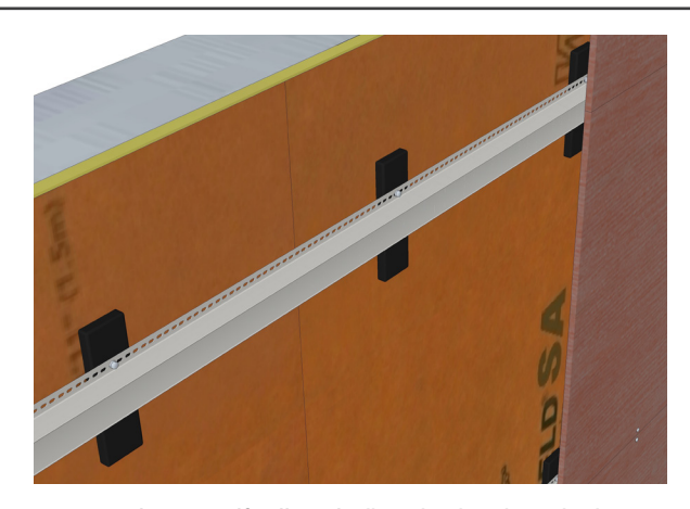
VaproShim SA Self-Adhered adhered to hat channel, when installed VaproShim SA will seal fastener penetrations and create a vertical rain screen drainage plane, adding significant drying capacity to the building envelope.