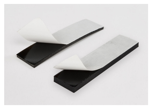
Available in 2 sizes; VaproShim SA Self-Adhered 1/8"(left), 1/4"(right)