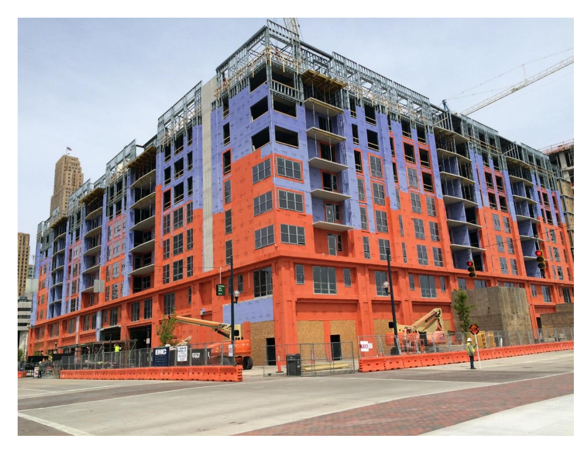
WrapShield SA Self-Adhered is applicable for all climates and weather conditions, and can be installed in temperatures as low as 20°F (-6° C) which made VaproShield a better choice than the fluid-applied product that would have been impractical and expensive to be applied in the windy, cold conditions of this project.