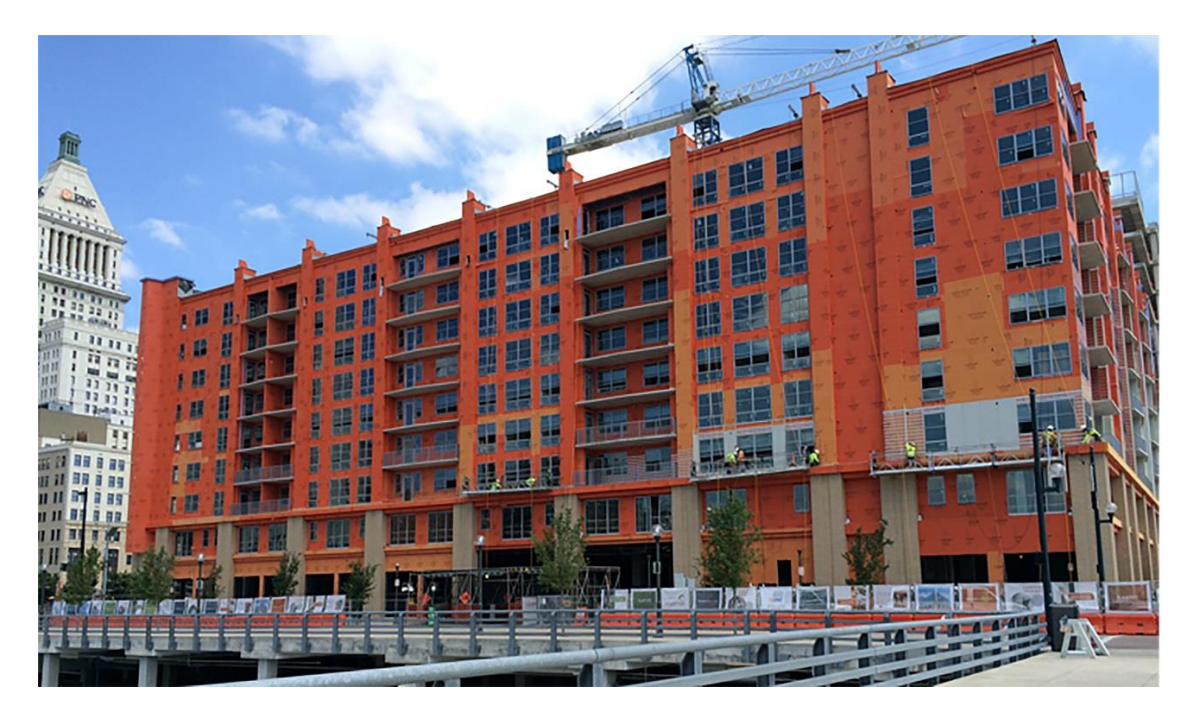
150,000 sq. ft. of WrapShield SA Self-Adhered Water Resistive Vapor Permeable Air Barrier sheet membrane was installed on The Banks Phase II Mixed-Use Building after initially choosing a fluid-applied product.