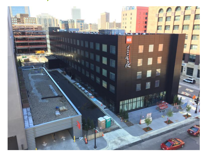
WrapShield SA Self-Adhered was installed behind aluminum panels on the new Radisson Red hotel in Minneapolis, MN.

The Minneapolis location is one of the first four Radisson Red hotels. Radisson plans to open 60 Radisson Red hotels globally by 2020. The hotel is geared toward tech-savvy individuals and offers a highly personalized experience.