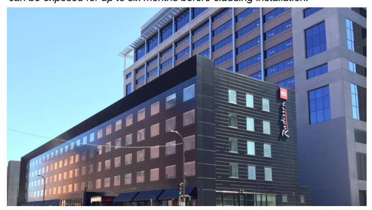
Over 60,000 sq.ft. of WrapShield SA Self Adhered was installed on the Minnesota location.