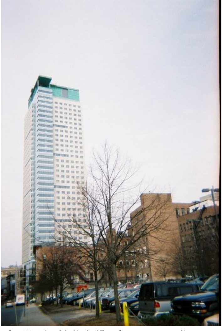
Over 30 stories of the Hartford Town Square were covered in VaporShield WallShield Water Resistive Barrier Sheet.