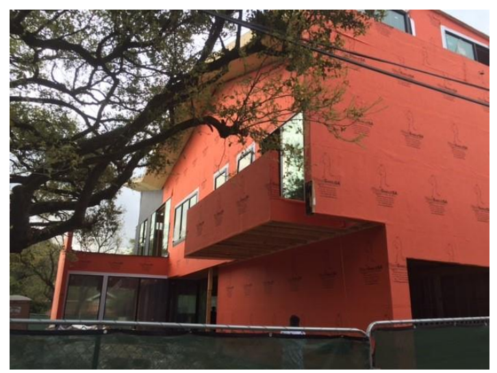
RevealShield SA Self-Adhered and WrapShield SA Self-Adhered do not require any substrate preparation, reducing labor costs.