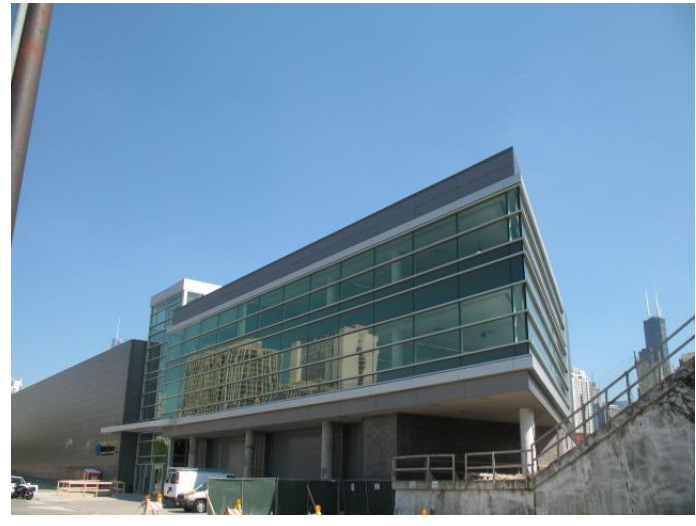
Over 3,000 sq.ft. of WrapShield Water Resistive Vapor Permeable Air Barrier Membrane was installed.