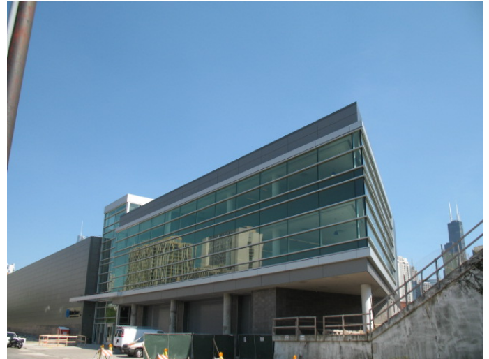
Over 3,000 sq.ft. of WrapShield Water Resistive Vapor Permeable Air Barrier Membrane was installed.