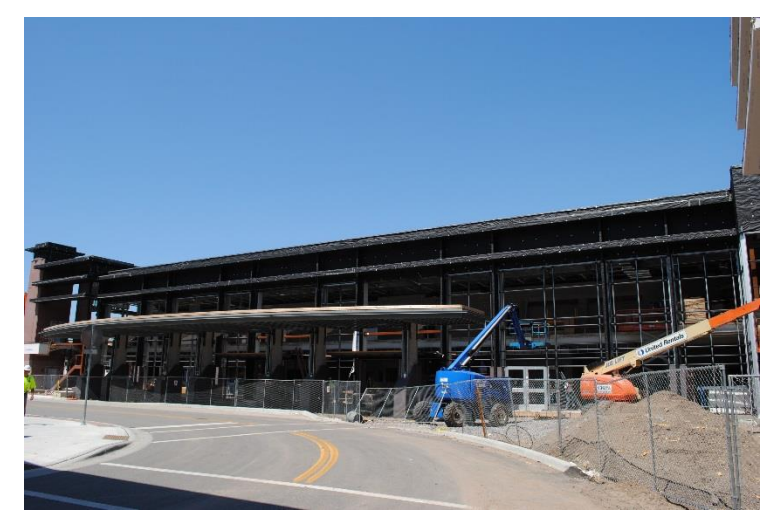
The $22M expansion project will double the floor space of the convention center.