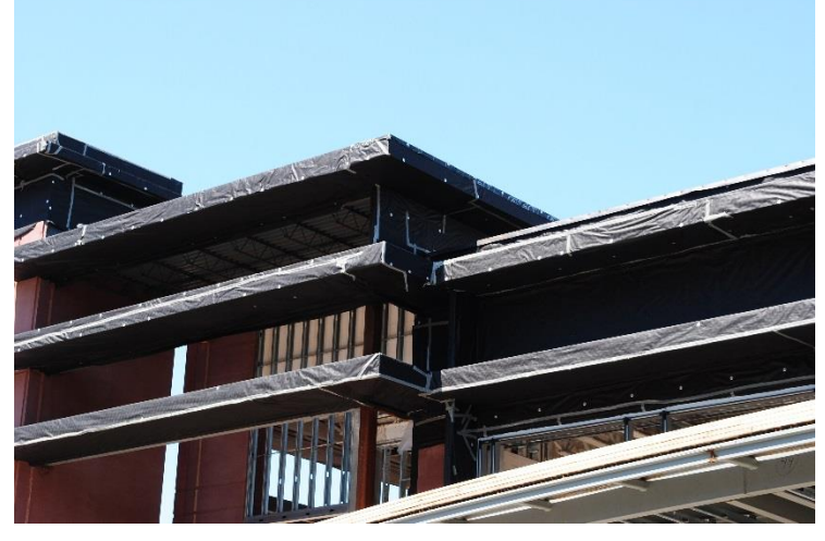
Over 40,000 sq.ft. of WrapShield Black Water Resistive Vapor Permeable Air Barrier Membrane was installed on the St. Cloud Civic Center.