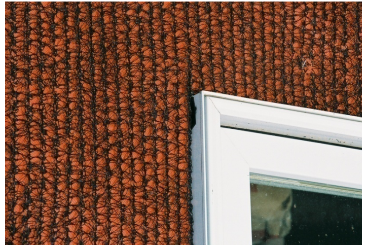
WrapShield HS close up around window shows its unique three-dimensional matrix allowing moisture to escape quickly while protecting the sidewall from the damaging effects of mold, mildew and moisture intrusion.

One unique product combining a rain screen membrane with a water resistive barrier that simultaneously saves on labor and material. Suitable for use in commercial, mixed-use and residential construction.