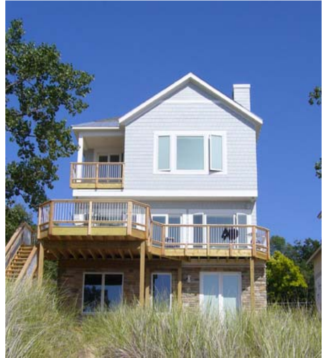
Above/Below: Completed home with WrapShield HS under multiple veneers.