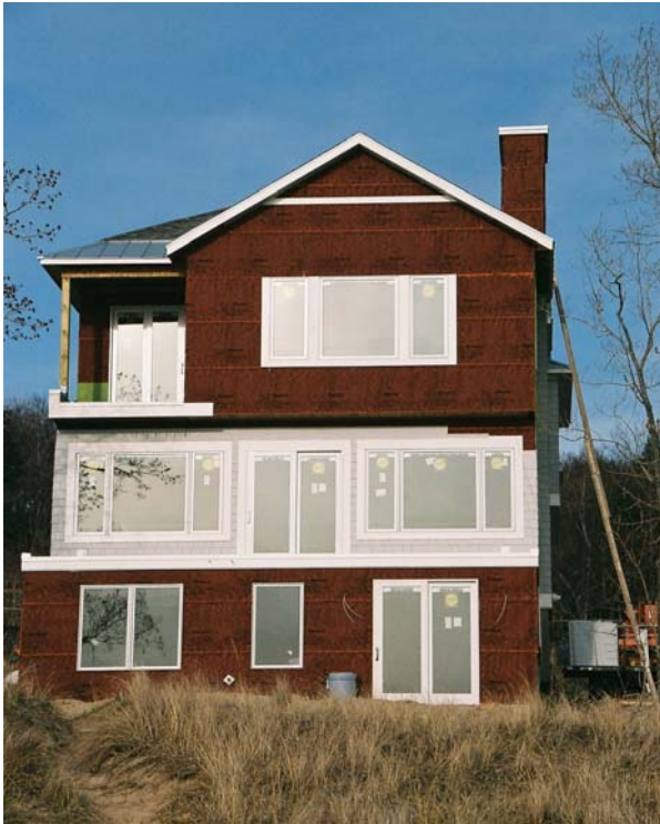
Above: This view is the home faces the Lake Michigan, which will receive the full effects and extremes of Michigan summers and winters.