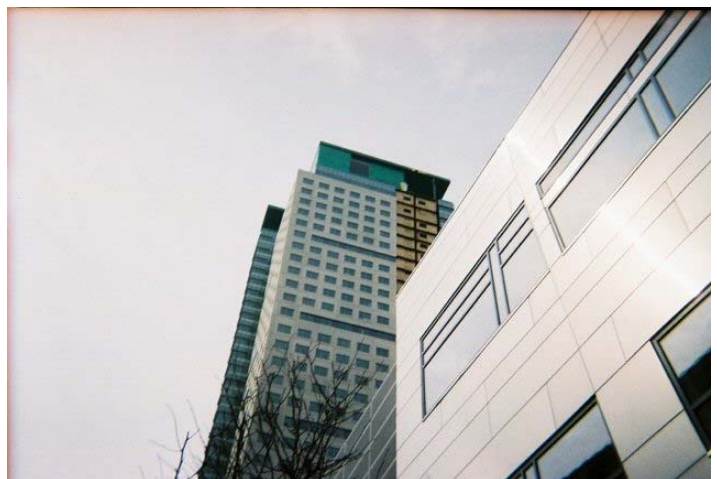
VaproShield offers specific installation fastener spacings for structures between 70 to 625 feet in height, differentiated by exposure, building category, fixing types and wind speeds.