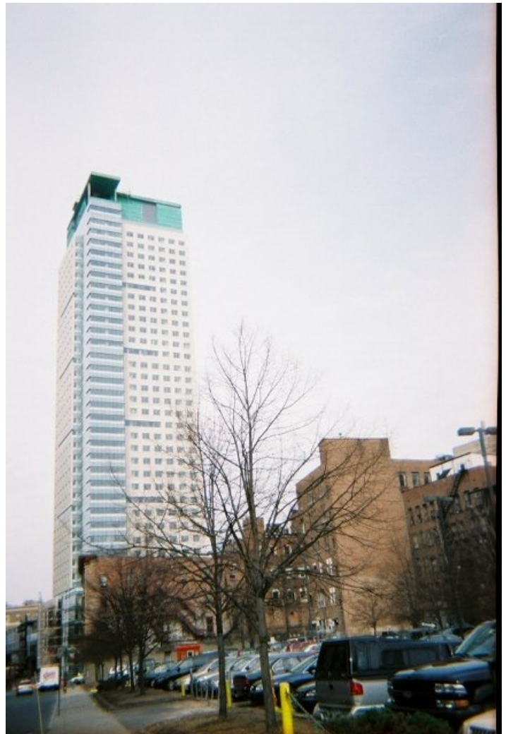
Over 30 stories of the Hartford Town Square were covered in VaporShield WallShield Water Resistive Barrier Sheet.

WallShield was chosen because it can be installed on high rise structures and it is the most vapor and air permeable weather resistant membrane in the industry. With a rating of 212 perms, WallShield allows trapped interior moisture to escape, reducing the risk of mold, mildew and rot.