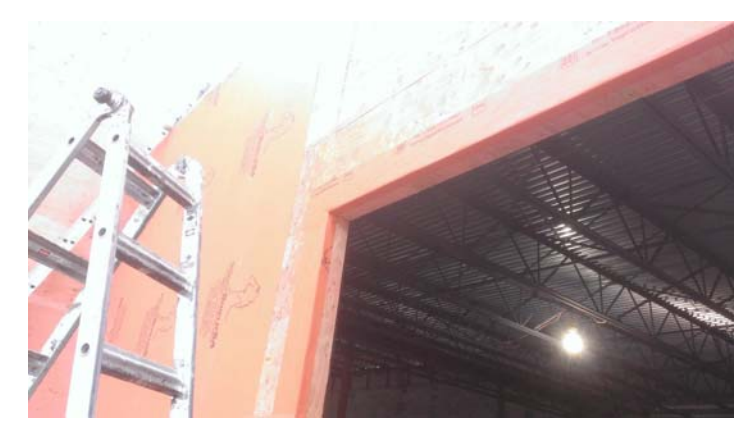
Over 10,500 sq. ft. of WrapShield SA Self-Adhered is installed on the Audi Dealership of Mentor, Ohio.

WrapShield SA Self-Adhered installed easily. The fully self-adhering product does not require a primer and was installed with zero air bubbles or wrinkles. WrapShield SA Seld-Adhered provided a snug fit while still allowing vapor condensation to escape the building envelope. This innovative membrane prevents mold, mildew and rot from forming to ensure building longevity and good indoor air quality for building occupants.