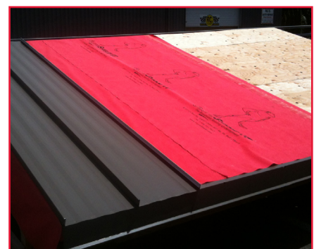
SlopeShield's unique Integrated Tape joints offer significant labor savings, allowing vertical installation concurrent with the metal roofing.