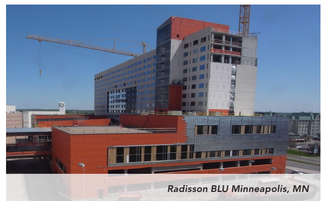
Radisson BLU Minneapolis, MN

WrapShield SA Self-Adhered innovative adhesive bonds directly to virtually all substrates by simply pulling off the clear release paper and smoothing with a roller.