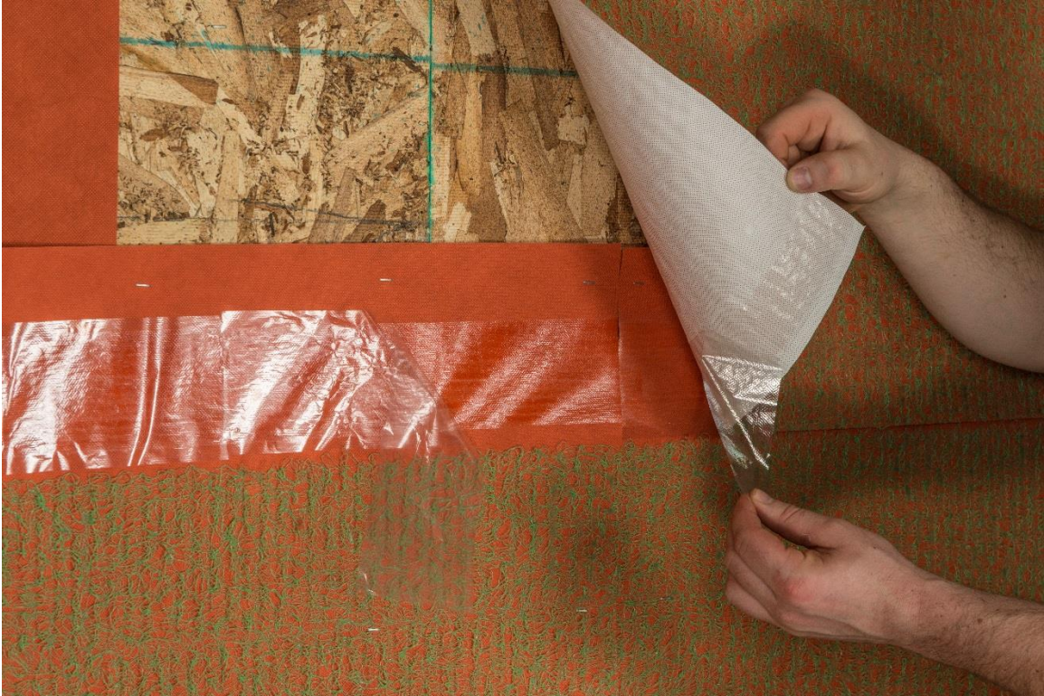
Factory installed integrated tape adheres in all weather conditions, including below freezing temperatures, wind and rain.