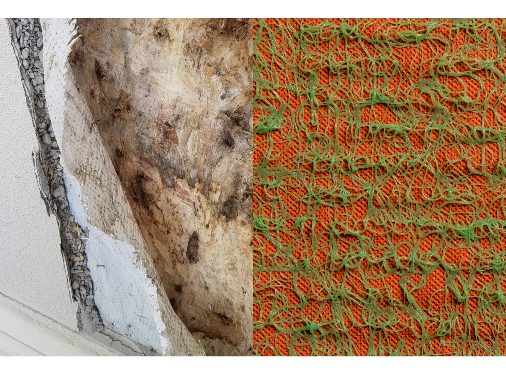
Luxury Residence Suffers Extensive Moisture Damage